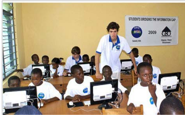
The student in the computer Lab with members of New Jersey based International NGO

New Jersey based International NGO, Students Bridging the Information Gap (SBIG), has completed another computer lab and library complex this time for New Life International Children's Home (New Life) located in Ansapatu in the central region.